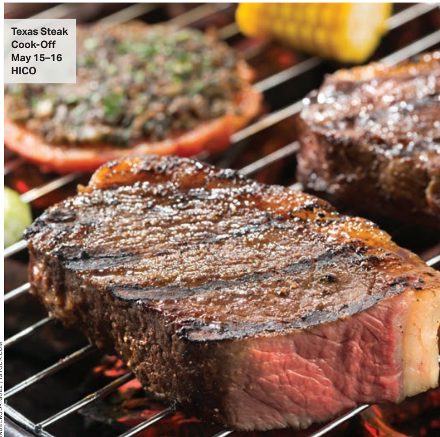
Texas Steak Cook-Off May 15–16 HICO

For more information about Goldthwaite events, visit goldthwaiteareachamber.com , call the Goldthwaite Area Chamber of Commerce at (325) 648-3619 or email gcc@centex.net .